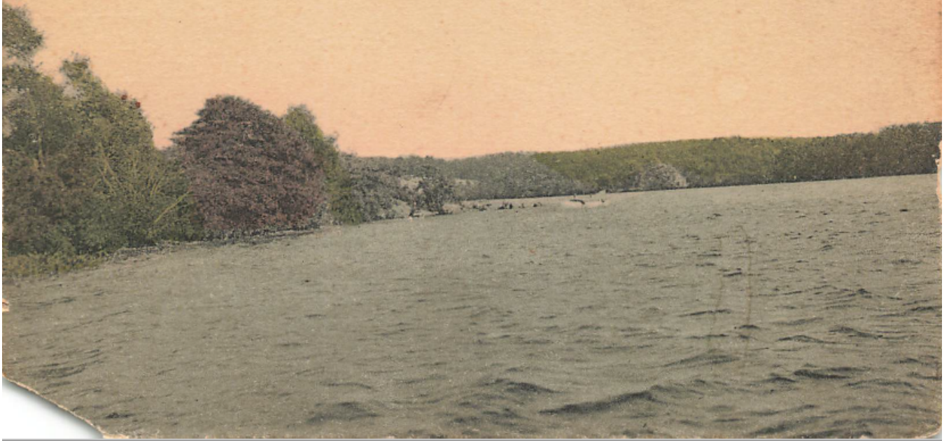
LAKE MANOMET, FROM THE WILLOWS